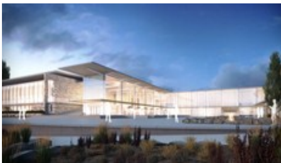
Lory Student Center Sketch Design