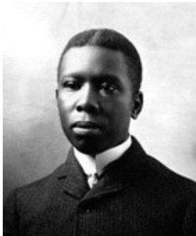
Paul Laurence Dunbar

I am the mother of sorrows, I am the ender of grief; I am the bud and the blossom, I am the late-falling leaf.