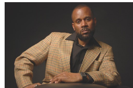
Bruce George, Photo courtesy of: greatblackspeakers.com

"At all costs, do not maintain neutrality. Challenge authority. I want people to see the truth."