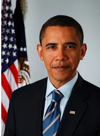
President Barack Obama

Many believe that those who see no improvement fail to realize where the president had to start off. There were many issues with the United States when Barack Obama took his place in the White House, and slowly but surely he is making change.