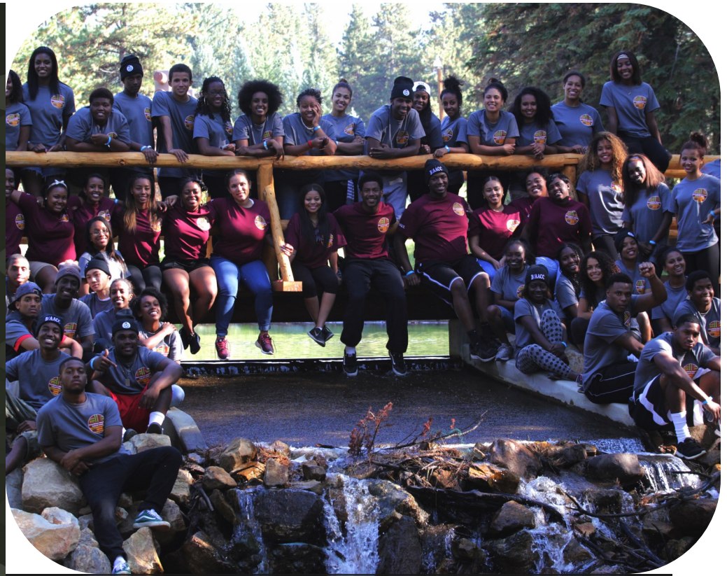
Group Picture from the Retreat

You walk on a bus full of other people that are alike to the standard perception but different in personal identification. There is only a selected few who you know, so you make a mission sit by them. You sit. When the bus starts moving you notice those who are speaking to the people around them, laughing, and some who are silently listening to their music. You may fall asleep on the road or you may not but when the bus of 30 something or more people pull up to the cabin in Estes Park, you feel excited and ready for the weekend so many upper-classmen told you to be a part of.