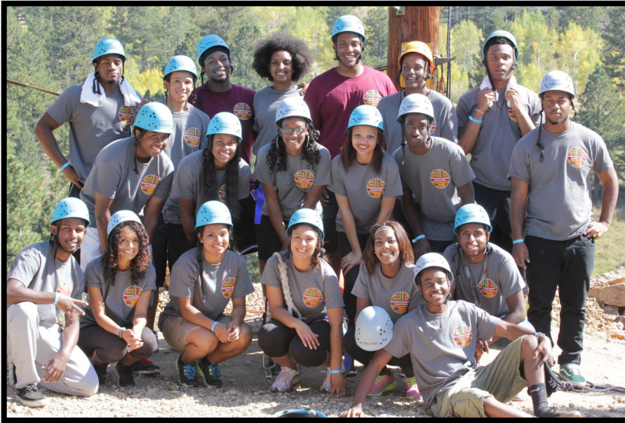
A few students enjoying their time at the R.O.P. Retreat (2014)